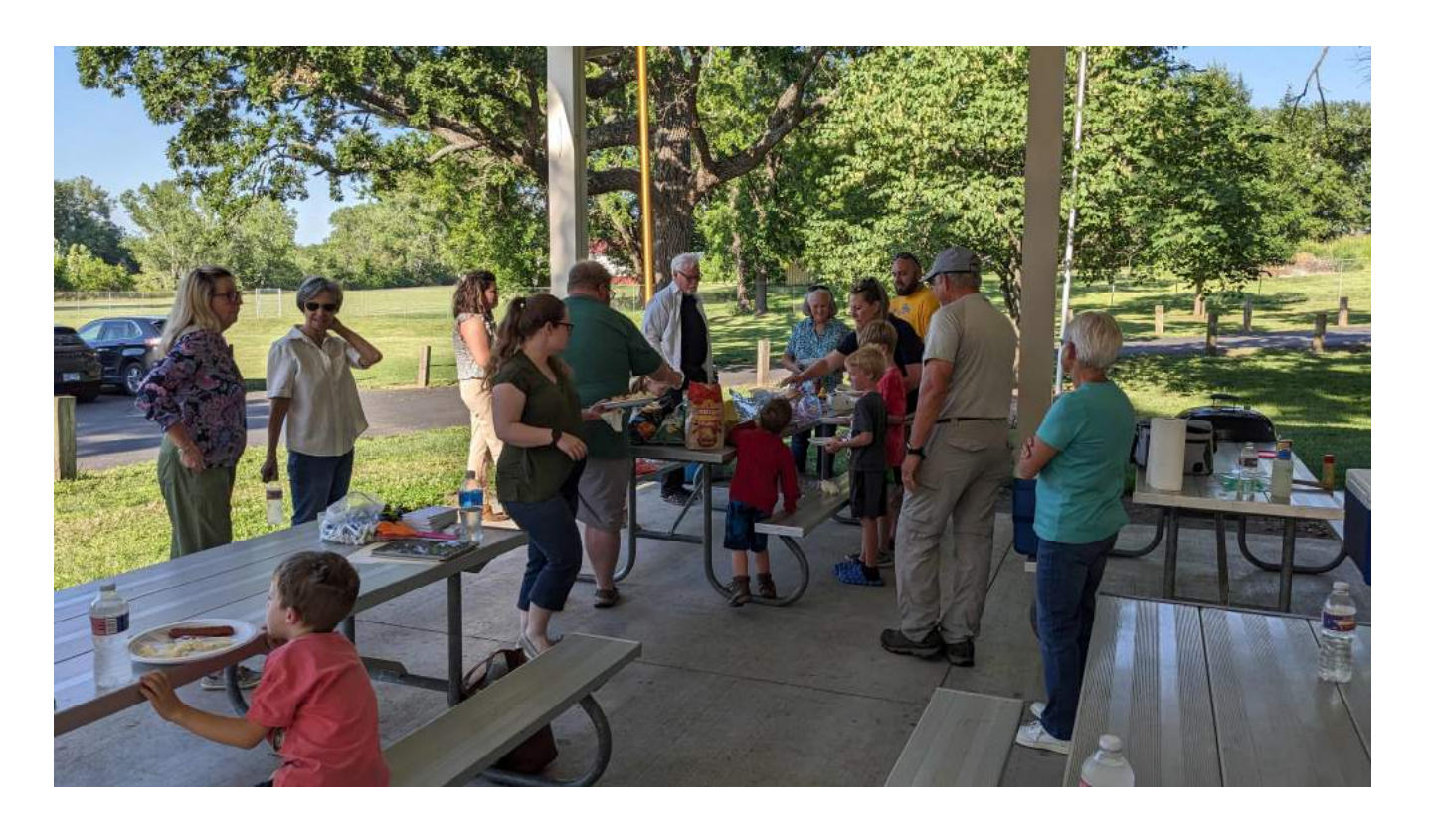
Family picnic at Tecumseh Park