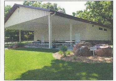
Tecumseh Park Shelter